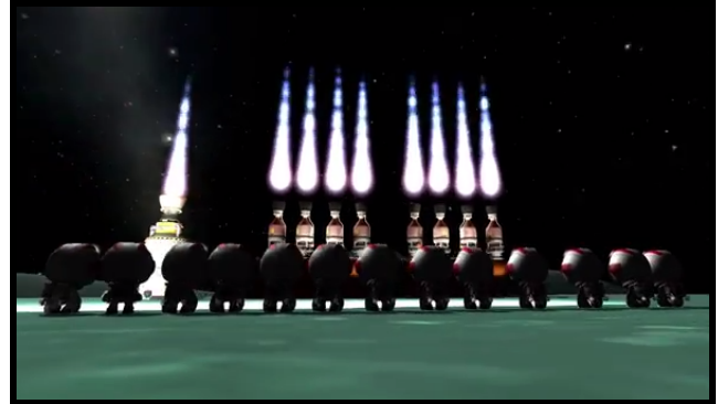
Menorah in Kerbal Space Program